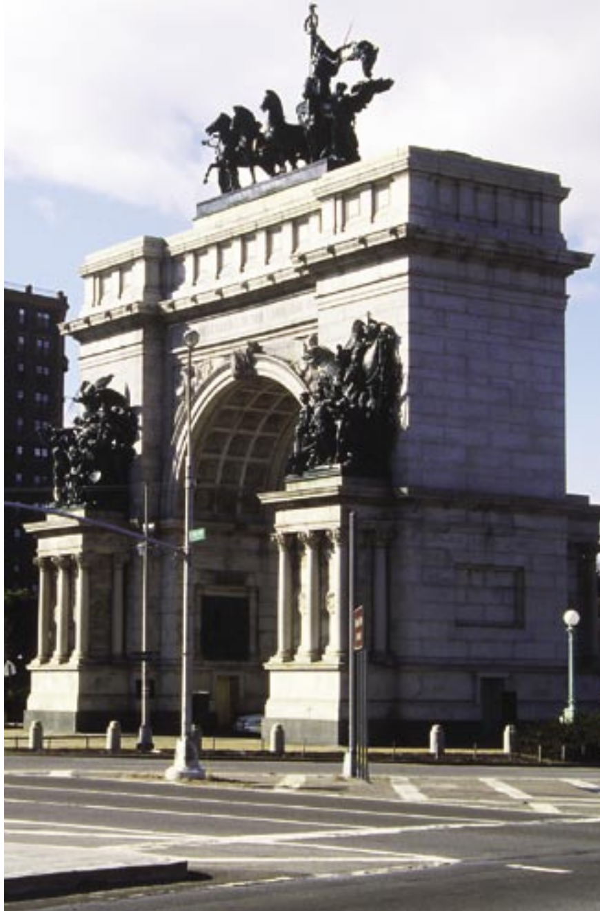
The Memorial Arch at Grand Army Plaza

became larger, more experimentation occurred in revival styles, including Italianate, Second Empire, Victorian Gothic, Romanesque, neo-Grec, and Classical. The area enjoyed a period of unmatched elegance throughout the nineteenth century. With the opening of the Interborough Rapid Transit system (IRT) in 1908, Brooklyn Heights was no longer secluded, making it far easier to live there and work elsewhere in the city. Many mansions became divided into apartments and boarding houses, and artists flocked to the neighborhood. But by the Depression era, the middle class had disappeared, and boarding houses had deteriorated into slums.