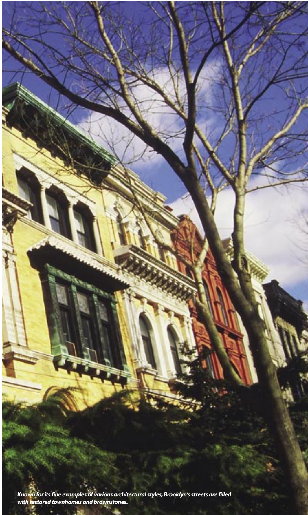
Known for its fine examples of various architectural styles, Brooklyn's streets are filled with restored townhomes and brownstones.

Park Slope Sports Club , 330 Flatbush Avenue