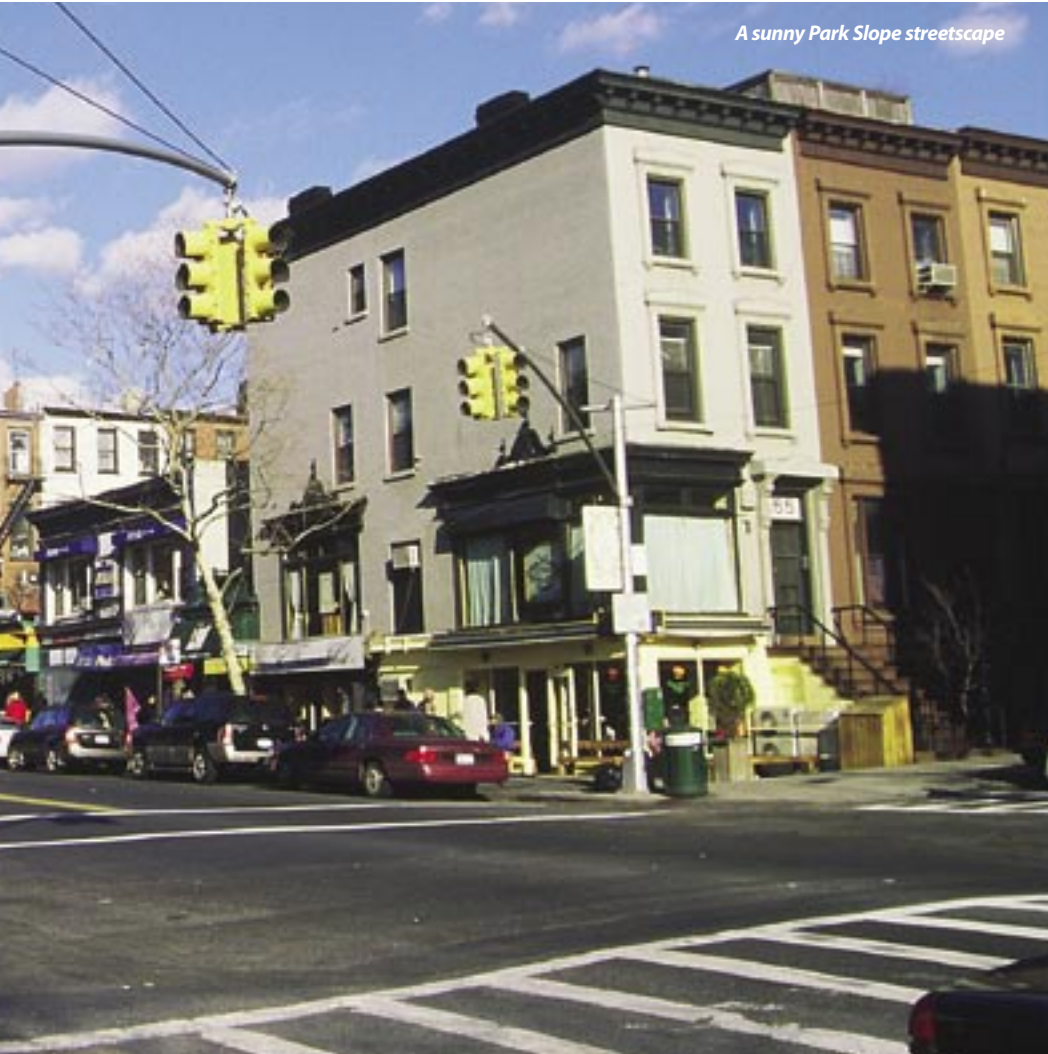
A sunny Park Slope streetscape

Brooklyn Children's Museum , 145 Brooklyn Avenue & St. Marks Avenue, is the world's first museum created expressly for kids. Offers a collection of over 27,000 objects including natural history pieces and an outstanding doll collection.