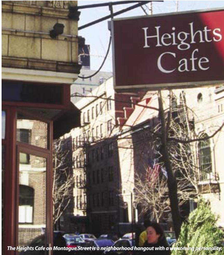
The Heights Cafe on Montague Street is a neighborhood hangout with a welcoming personality.

rows of brownstones were demolished to make room for institutional dorms and apartment buildings. In reaction, local residents formed the Brooklyn Heights Association to plan an Esplanade of park space along the East River. In 1965, a local group of residents called the Community Conservation and Improvement Council succeeded in having the neighborhood listed on the National Register of Historic Places and as the first Historic District in New York City. Later gentrification in the 1970s and 80s led to the transformation of boarding houses into middle-class residences and condominiums.