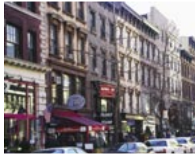
The proud borough of Brooklyn, NY lies just across the East River from Manhattan and maintains its own unmistakable identity, famous for everything from pizza to egg creams to “Dem Bums” of the 40s and 50s, the Dodgers.

The most heavily populated borough of New York City, Brooklyn consists of 81 square miles on the southwestern tip of Long Island. Officially designated a borough of New