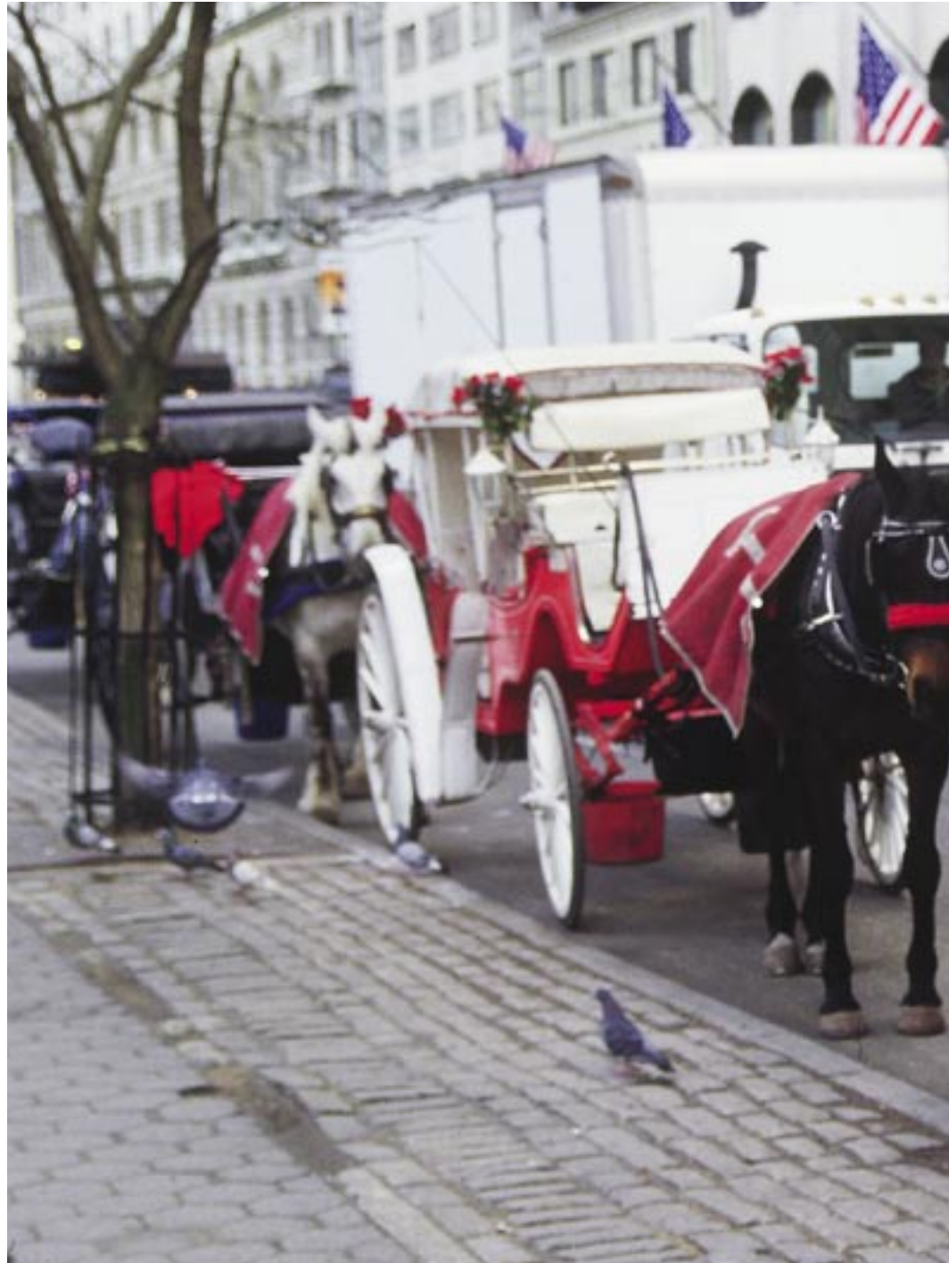
The San Remo