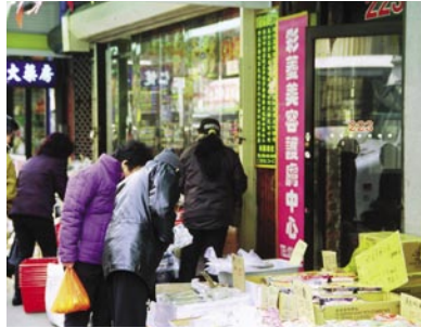
The first major settling place for Chinese immigrants on the East Coast, the Lower East Side's Chinatown remains one of the largest, most active Asian gathering points in the world.

M ore than 200 years ago, extended families from around the world pursued the American Dream by coming to New York and living on the Lower East Side. A place where dreams materi-