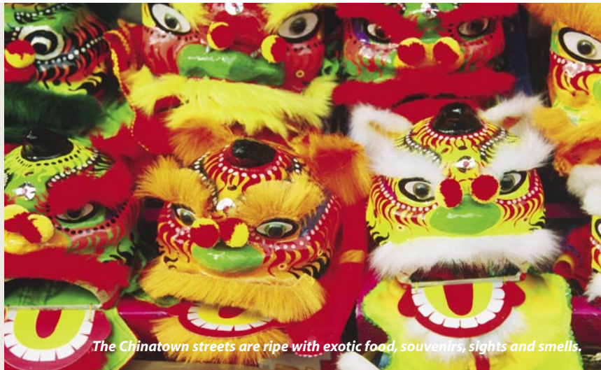
The Chinatown streets are ripe with exotic food, souvenirs, sights and smells.

The first Chinese immigrants were primarily railroad workers who came from the West in the 1870s to settle in a limited section of the Lower East Side. Chinatown came to be in the late 1880s when male Chinese immigrants settled in a small section of tenements on the lower end of Mott Street, as well as nearby Pell and Doyer Streets. For nearly a century, anti-immigration laws forbid most men to have their families join them, making the neighborhood a “bachelor society” with a static population. At the end of World War II, Chinese immigration quotas were increased, bringing about neighborhood expansion. New arrivals continued to pour into this noisy, crowded area to live and work, and now Chinatown is as lively as ever, filled with souvenir shops and authentic restaurants in pagoda-style buildings.