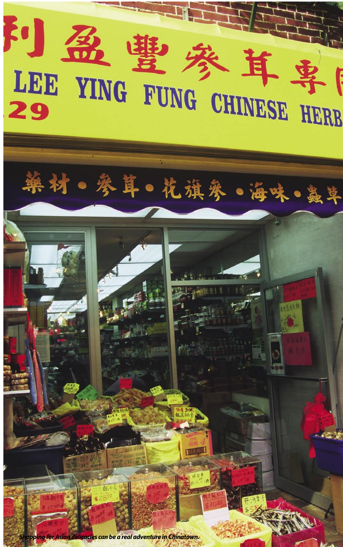
Shopping for Asian delicacies can be a real adventure in Chinatown.

Seward Park on the South End was created from land acquired in 1897 and opened officially in 1903. The park was named after William H. Seward, governor of the State of New York, a U.S. senator, and eventually secretary of state under Abraham Lincoln. Today basketball and handball courts keep visitors active.