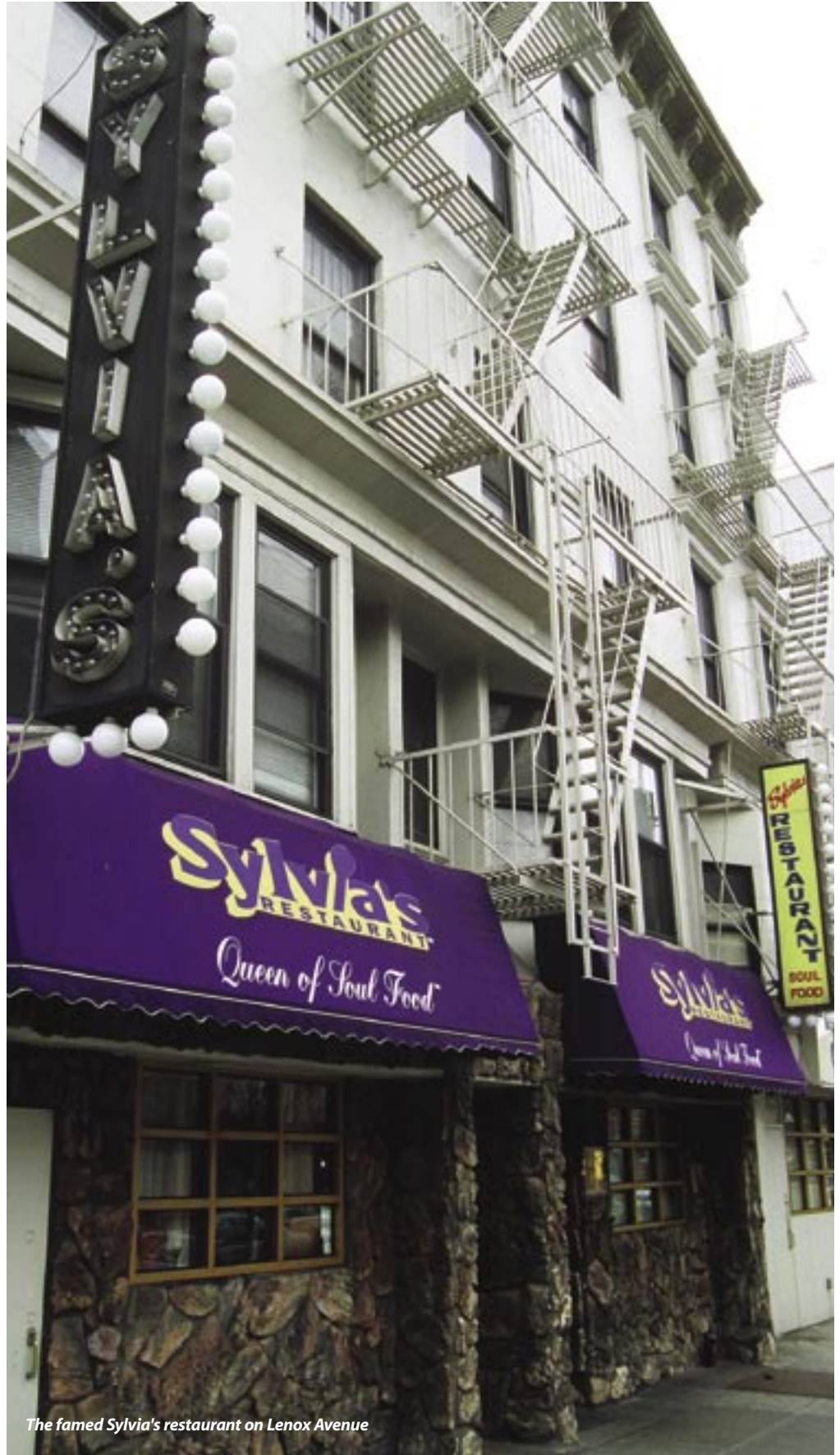
The famed Sylvia's restaurant on Lenox Avenue

Museum of The City of NY , 1220 Fifth Avenue & 103rd Street, is a private, not-for-profit educational corporation founded in 1923 for the purpose of presenting the history of New