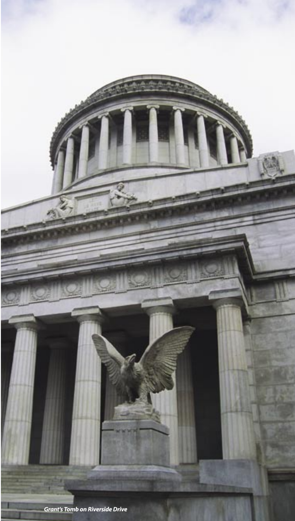
Grant's Tomb on Riverside Drive

York City and its people as a learning resource. The Museum fulfills its mission through exhibitions, educational activities, and publications and by acquiring, preserving, and documenting original cultural materials that reflect New York City's history. In carrying out its mission, the Museum provides New Yorkers and visitors an understanding of the individual and shared heritages that have characterized New York City, and the sense of identity that is essential to the well being of all members of the community.