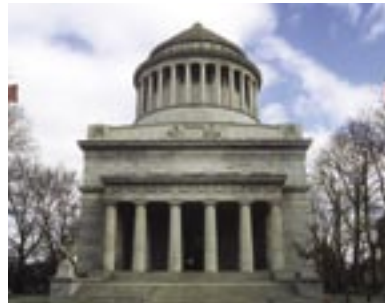
Today, Harlem continues to enjoy a resurgence of popularity. Even former President of the United States William Jefferson Clinton has chosen to establish his private office in Harlem.

H arlem is the section of Manhattan that lies north of 110th Street and south of the Harlem River, bounded by Fifth Avenue to the East and Morningside and St. Nicholas Avenues to