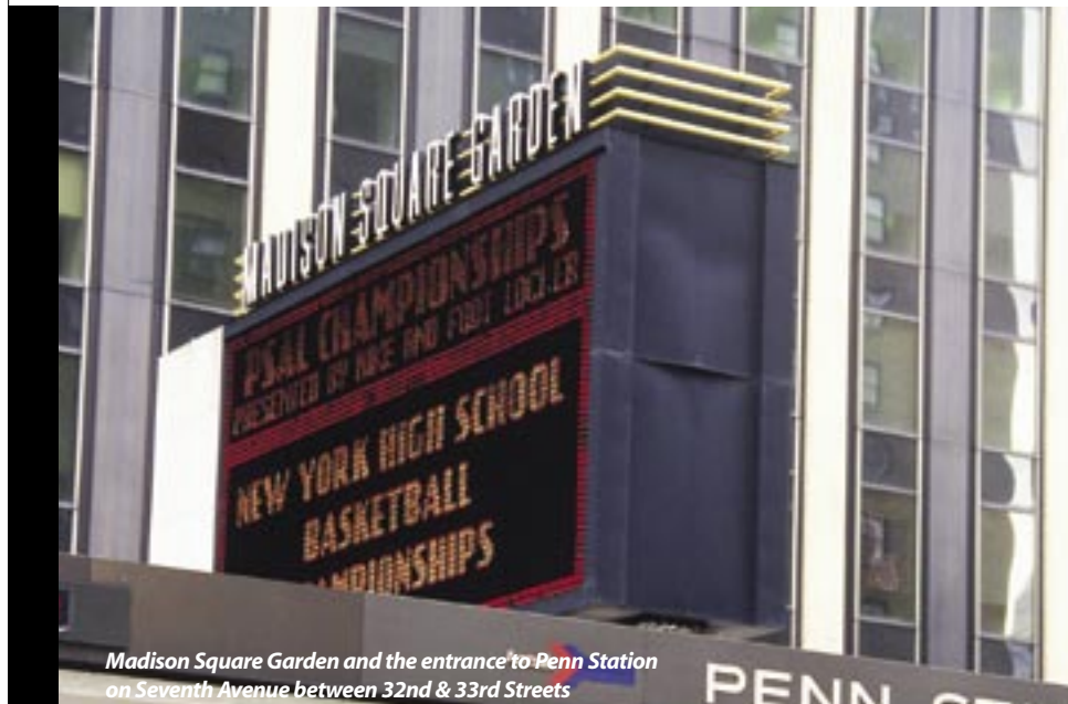
Madison Square Garden and the entrance to Penn Station on Seventh Avenue between 32nd & 33rd Streets

Madison Square Garden , at 33rd Street & Seventh Avenue, home to the New York Knicks basketball, and New York Rangers hockey teams, the famous arena has also played host to some of the biggest sporting, music, theater, and political events ever to take place in Manhattan.