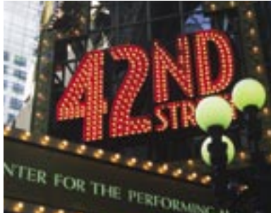
Approximately 36 theaters offering world-renown "Broadway" productions wow patrons nightly in the small slice of Manhattan known as the Theater District.

When most people think of New York City, they envision the bright lights, tall buildings and bustling crowds of Times Square and the Theater District. Midtown West, which sprawls from