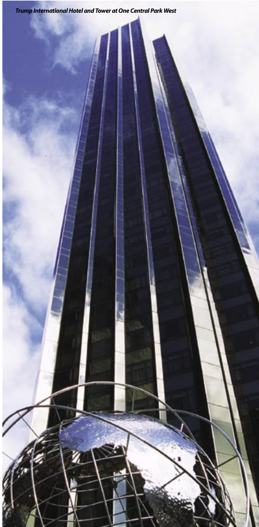
Trump International Hotel and Tower at One Central Park West

Café Gray , 10 Columbus Circle at 59th Street. This impeccable French fusion restaurant is a definite special occasion treat. The gorgeous space, design and details — all $6 million dollars worth — are the perfect backdrop to awe inspiring creations like chef Gray Kunz's acclaimed beef short ribs.